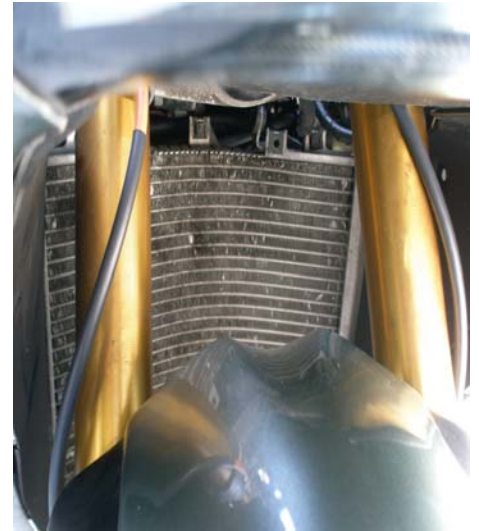
A5 (FRONT VIEW)