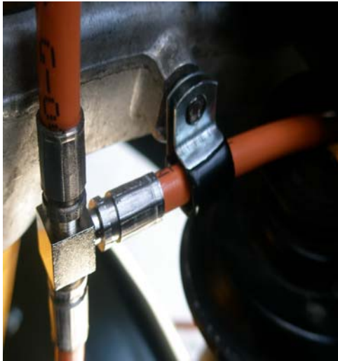
A3 CENTER OF FAIRING STAY