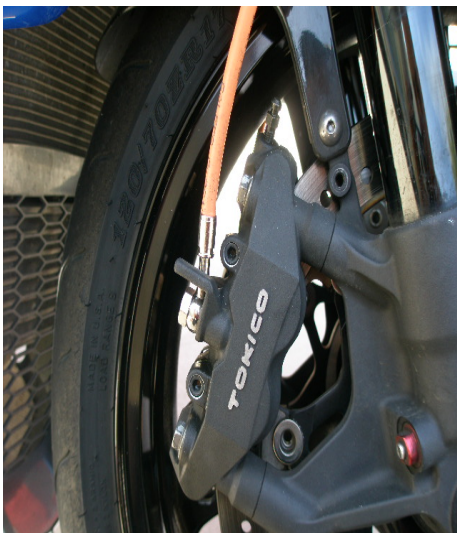
A6 (RIGHT CALIPER)