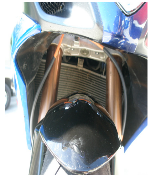
(A5) (FRONT VIEW)