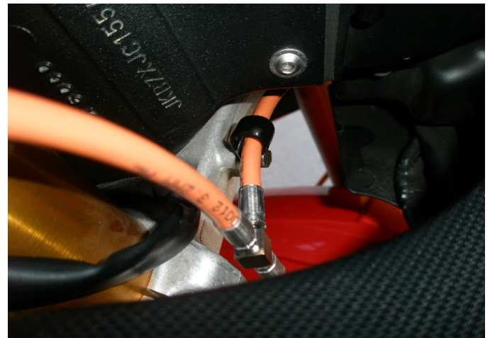
(A4) (TRIPLE TEE C-CLIP)