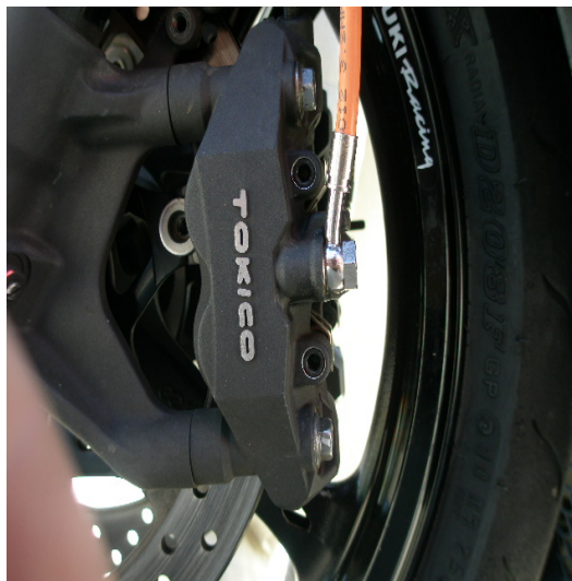
(A7) (LEFT CALIPER)