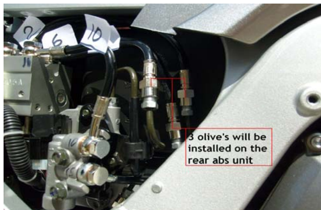
ABS UNIT LINES: 2, 4, 6, 8, 10 . LINES 2, 6, 8 WILL USE OLIVES