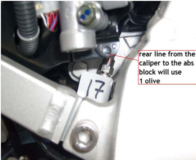
REAR LINE WITH OLIVE