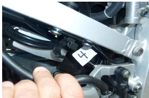
REAR MASTER CYLINDER LINE: 4