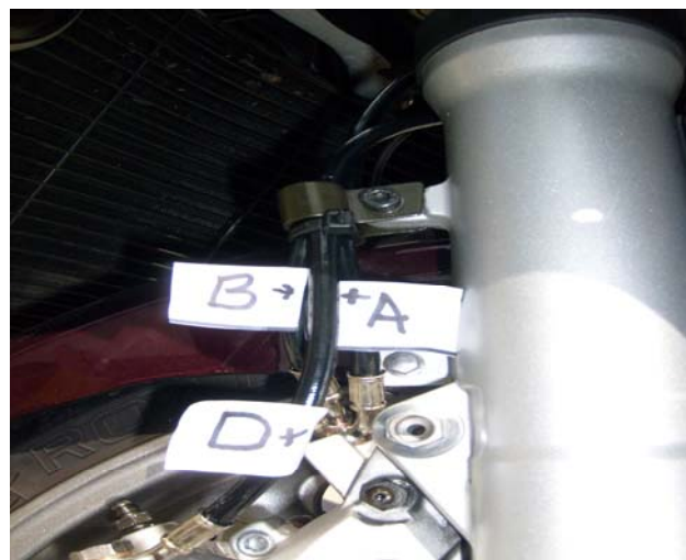
RIGHT CALIPER LINES: A, B, D