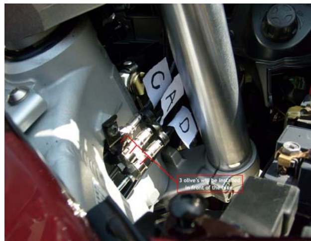
LINES: A, C, D WITH ONE OLIVE FOR EACH LINE