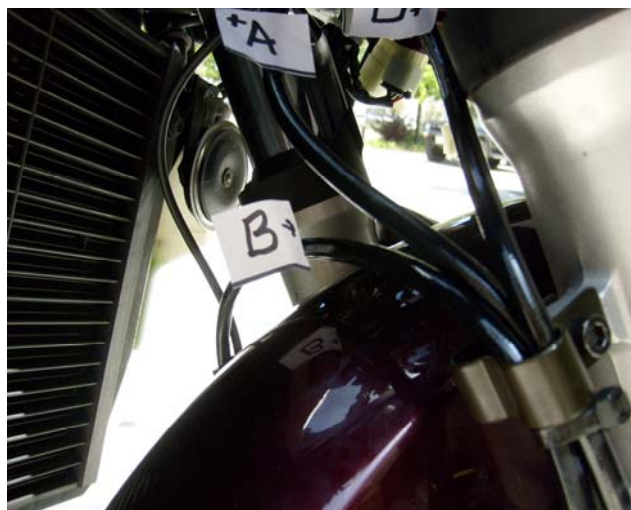
LINES A, B, D