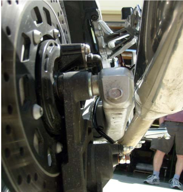
REAR CALIPER LINE: 17