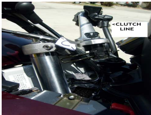
MASTER CYLINDER LINE: C AND CLUTCH