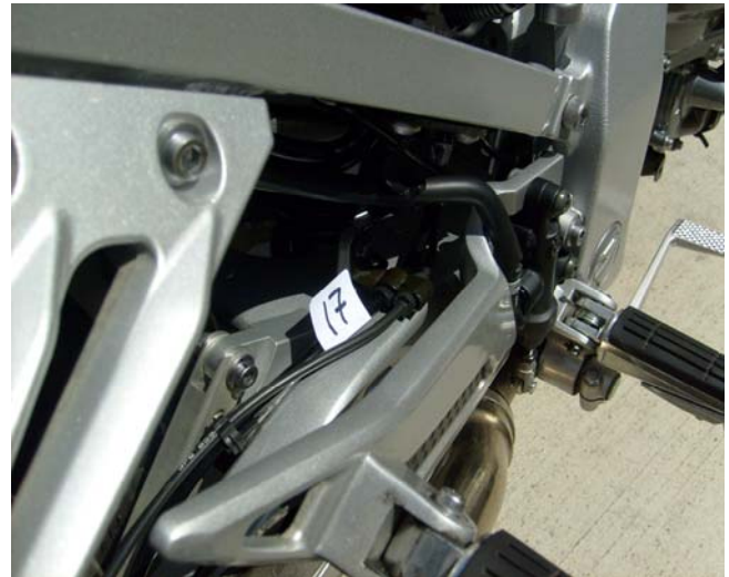
REAR LINE ROUTING DOWN THE SWING ARM