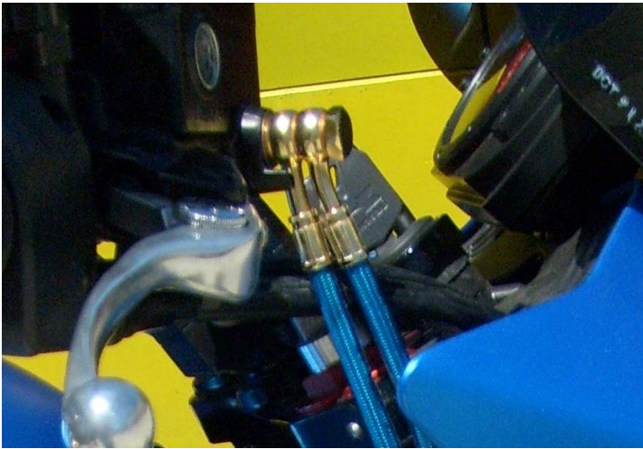
a. Front master cylinder