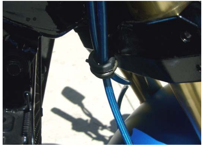
b. OEM line holder at lower triple tree