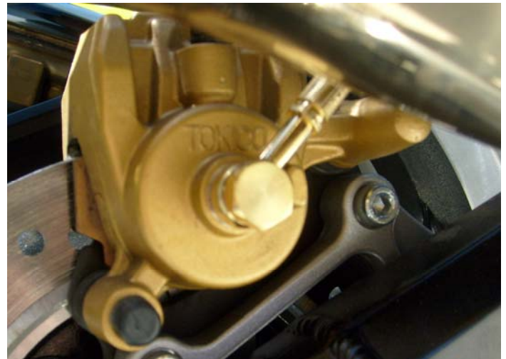
d. Rear caliper

GALFER USA 310 IRVING DRIVE OXNARD, CA 93030 PH (805) 988-2900 . FAX (800) 685-6633 WWW.GALFERUSA.COM