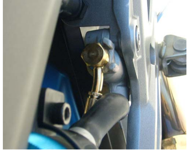
b. Rear master cylinder