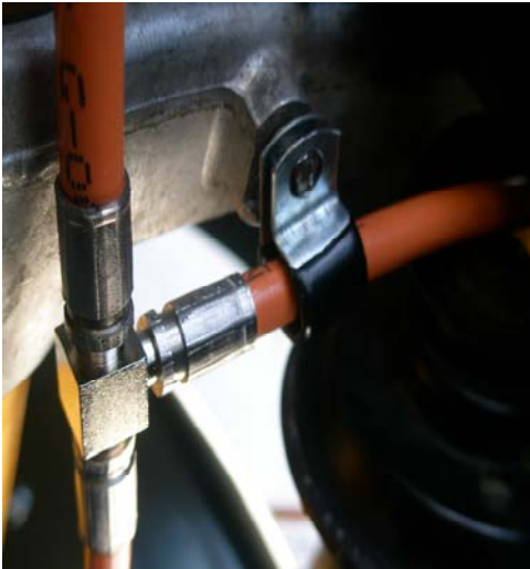
A3 CENTER OF FAIRING STAY