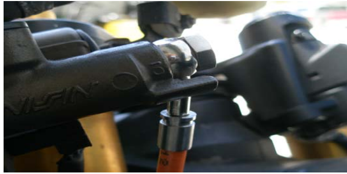
A2 (MASTER CYLINDER)