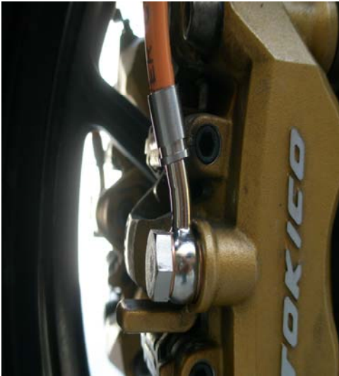
A6 (RIGHT CALIPER)