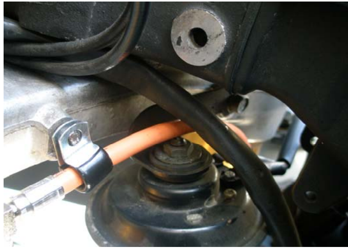
A4 (TRIPLE TEE C-CLIP)