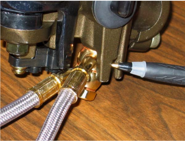
Master Cylinder Modification Picture A-1, to the left: Front master cylinder removed from bike, Galfer lines installed and pen indicating which tab to grind off

Please be aware that the overall braking feel has been changed dramatically. We suggest taking it easy while you get used to the new brake lever pressure and feel. We recommend checking your brake system periodically; be sure to check that your bolts are tight and VERY carefully check your lines for any leaks or damage. If there are any signs of damage or stress to the lines, the complete brake line kit will need to be replaced. Remember, our brake lines have a LIFETIME WARRANTY! If you have any problems or questions, do not hesitate to call our tech department - (800) 685-6633.