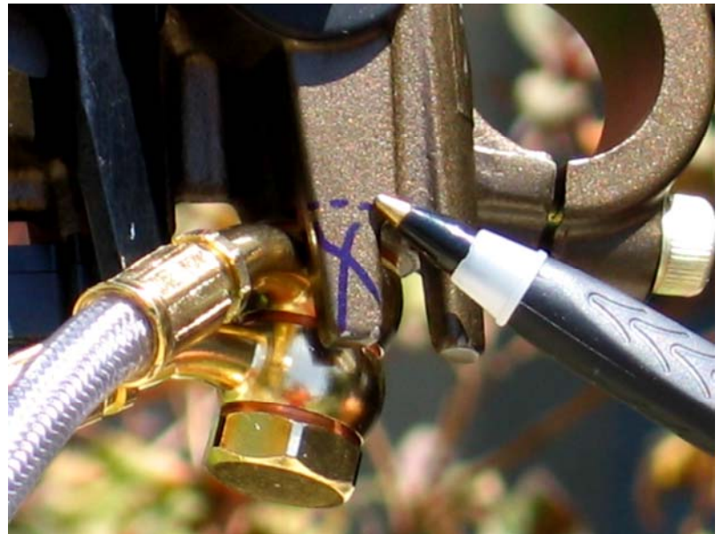
Master Cylinder Modification Picture A-2, to the right: Galfer lines installed with master cylinder on bike, pen and “X” indicate which tab to grind off, notice positioning of banjo fittings.