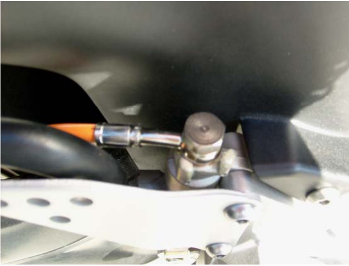
a. Rear master cylinder