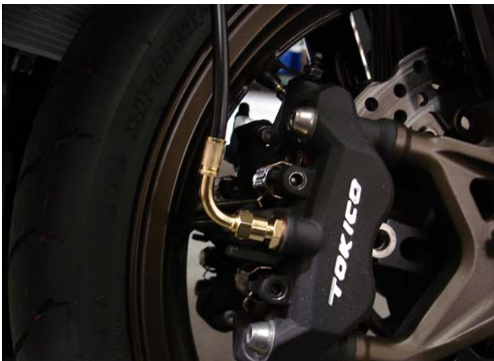
d. Right caliper, notice position of fitting