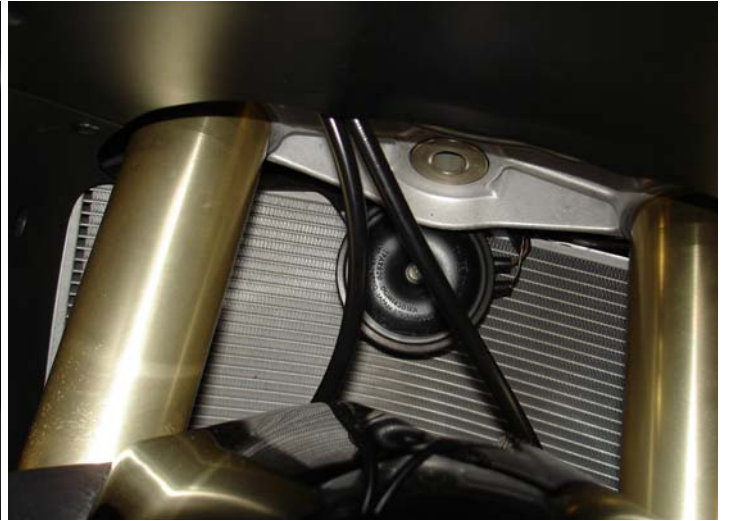
c. Lines routed behind forks, be sure to use the Galfer c-clip at the lower triple tree