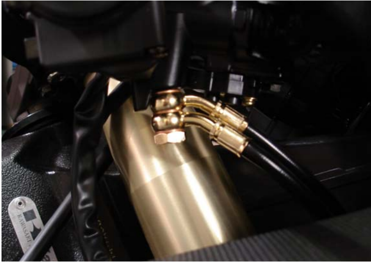
b. Front master cylinder, notice positioning of fittings