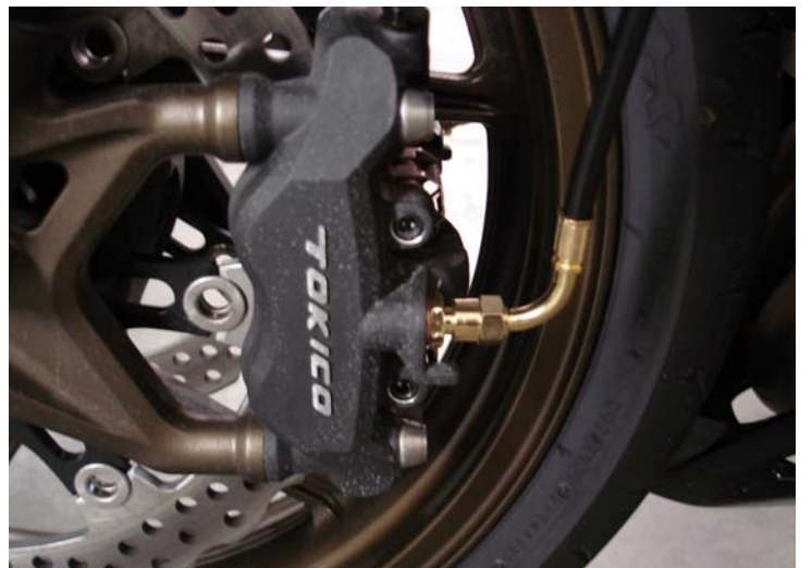
e. Left caliper, notice position of fitting

GALFER USA 310 IRVING DRIVE OXNARD, CA 93030 PH (805) 988-2900 . FAX (800) 685-6633 WWW.GALFERUSA.COM