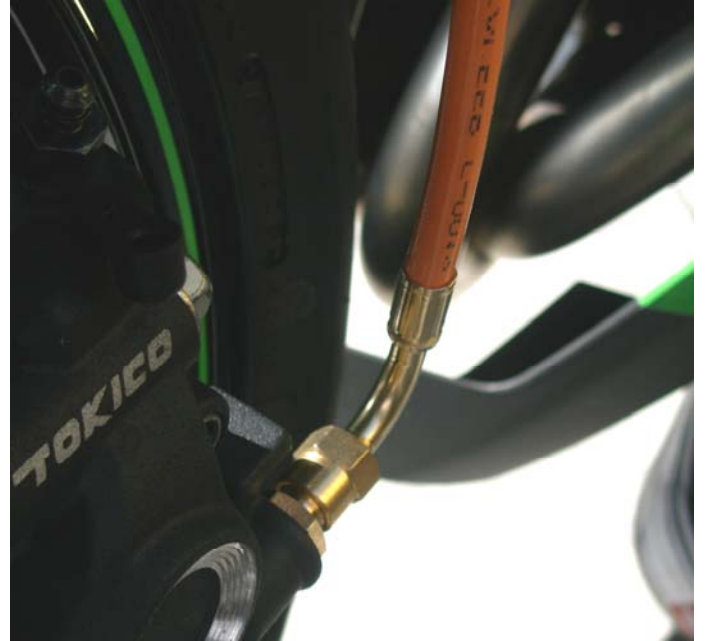
f. Left caliper, notice fitting is pointed away from bike

GALFER USA 310 IRVING DRIVE OXNARD, CA 93030 PH (805) 988-2900 . FAX (800) 685-6633 WWW.GALFERUSA.COM