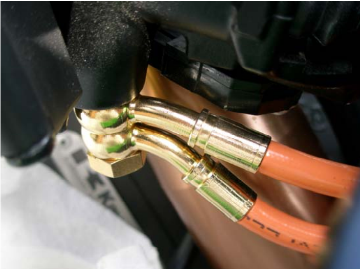
a. Front master cylinder

Please be aware that the overall braking feel has been changed dramatically. We suggest taking it easy while you get used to the new brake lever pressure and feel. We recommend checking your brake system periodically as well as before and after every race; be sure to check that your bolts are tight and VERY carefully check your lines for any leaks or damage. If there are any signs of damage or stress to the lines, the complete brake line kit will need to be replaced. Remember, our brake lines have a LIFETIME WARRANTY! If you have any problems or questions, do not hesitate to call our tech department - (800) 685-6633 .