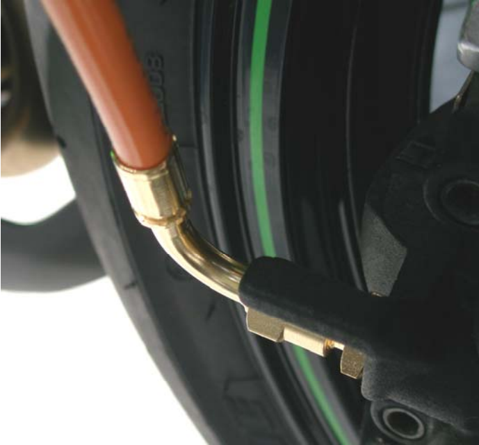
e. Right caliper, notice fitting is pointed away from bike