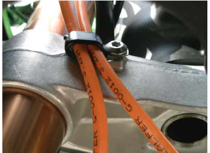
b. Galfer c-clip at lower triple tree