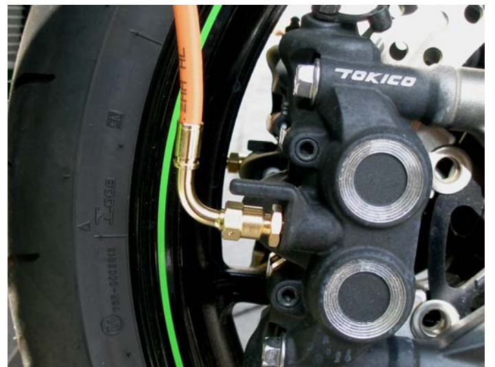
d. Right caliper

GALFER USA 310 IRVING DRIVE OXNARD, CA 93030 PH (805) 988-2900 . FAX (800) 685-6633 WWW.GALFERUSA.COM