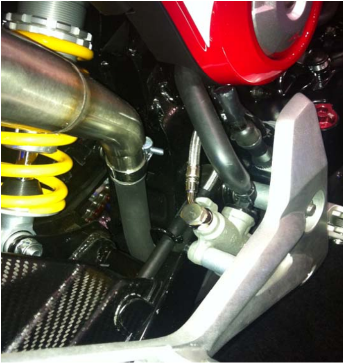
A. Rear Master Cylinder