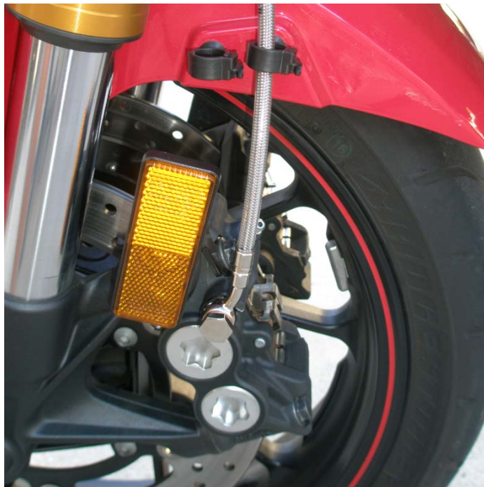
C. Left Caliper