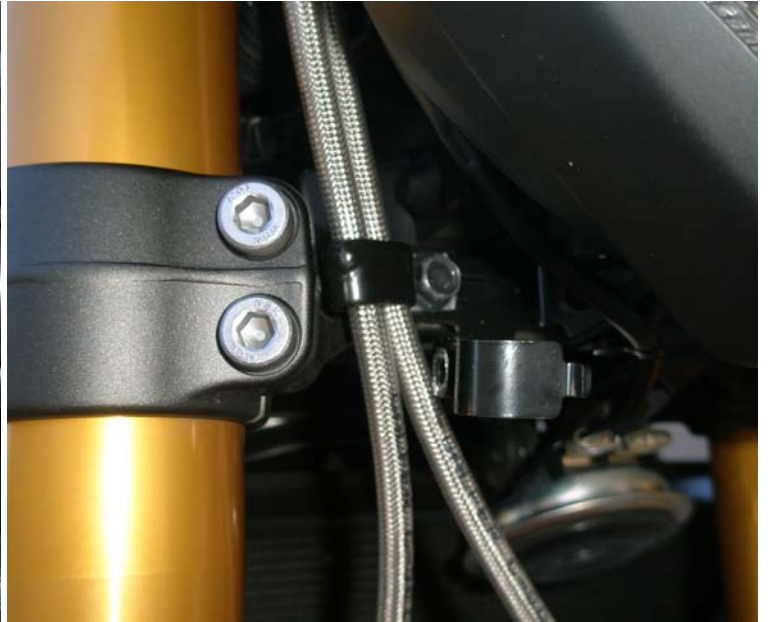
B. C-Clamp at Lower Triple Tree