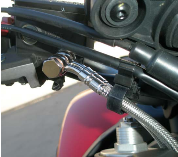
A. Master Cylinder