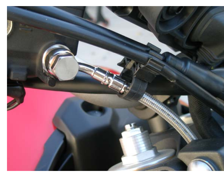
A. Line A at Master Cylinder

Please be aware that the overall braking feel has been changed dramatically. We suggest taking it easy while you get used to the new brake lever pressure and feel. We recommend checking your brake system periodically; be sure to check that your bolts are tight and VERY carefully check your lines for any leaks or damage. If there are any signs of damage or stress to the lines, the complete brake line kit will need to be replaced. Remember, our brake lines have a LIFETIME WARRANTY! If you have any problems or questions, do not hesitate to call our tech department - (800) 685-6633 .