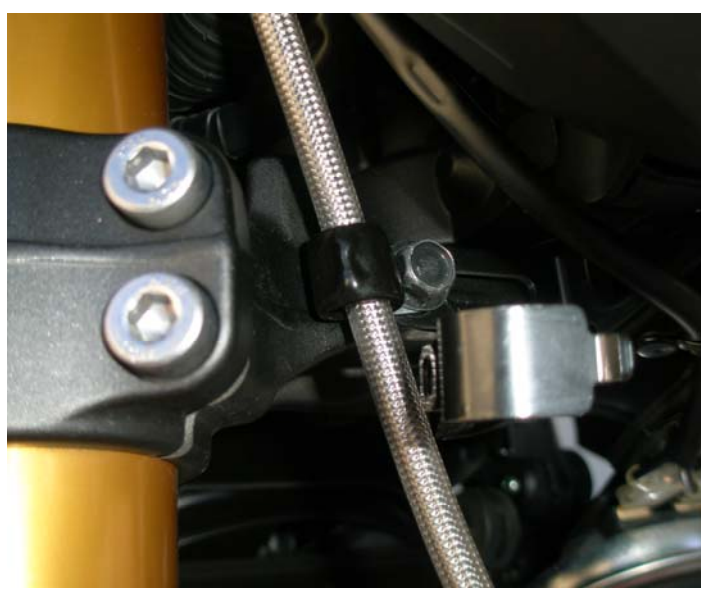
B. C-Clip at Lower Triple Tree