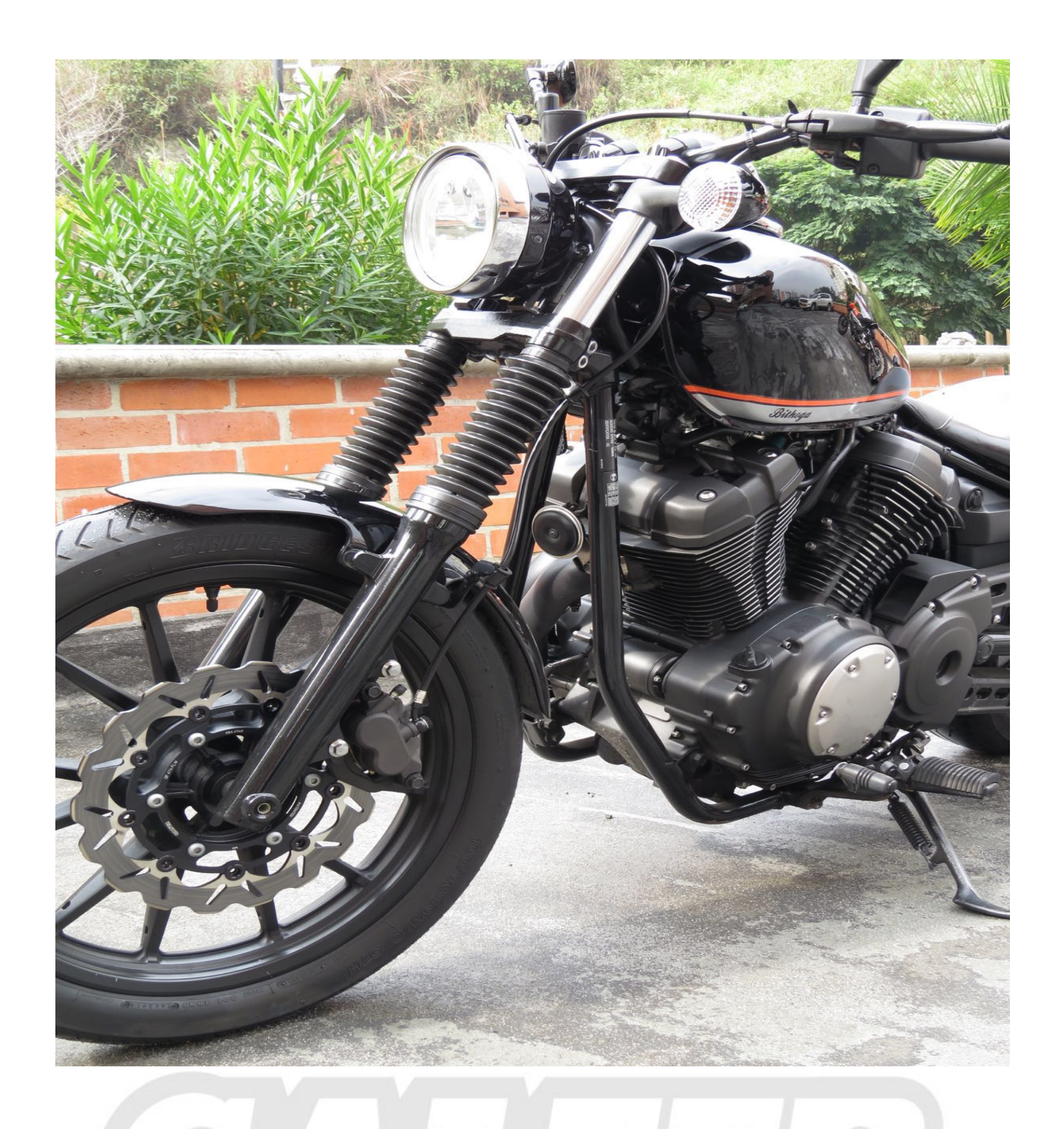
Step 4: Bleed brake system according to owner's manual, and build appropriate pressure. Finish with Galfer DOT-4 brake fluid. Once the bleeding has been done, please check brake fluid level on master cylinder. Fill if needed.